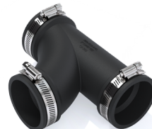
Tee PlumbQwik ™