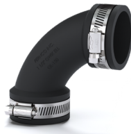
Elbow PlumbQwik ™