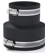
Adaptor PlumbQwik ™