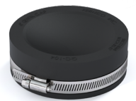
End Cap PlumbQwik ™