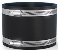
Straight PlumbQwik ™

pipe alignment, making them ideal for repair scenarios and rectifying previous bad workmanship. The product range covers all common pipe sizes as straight or adaptor (also known as reducer) applications.