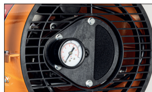
Air pump pressure gauge