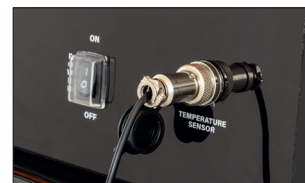
Remote sensor accurately determines target temperature