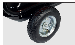
Heavy-duty pneumatic tyres for outstanding mobility