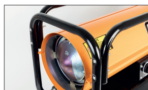
Rugged full frame design for added protection