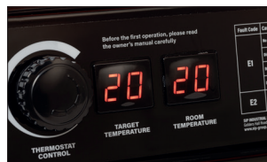
LED thermostat control