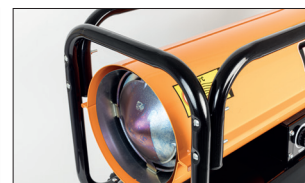
Rugged full frame design for added protection