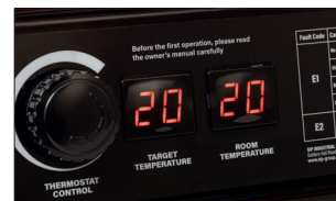
LED thermostat control