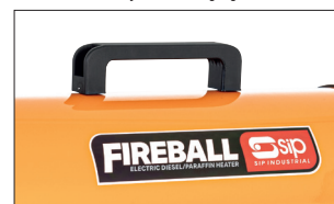
Carry handle for outstanding portability