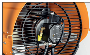
Danfoss gear pump for efficient fuel transfer