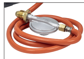
1.5mtr gas hose and regulator included