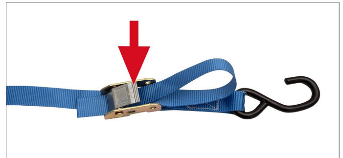
3 Press down the lock plate to feed webbing strap underneath.