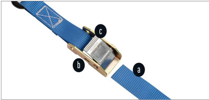
COMPONENT LIST: (a) Webbing strap (b) Cam buckle (c) Lock plate