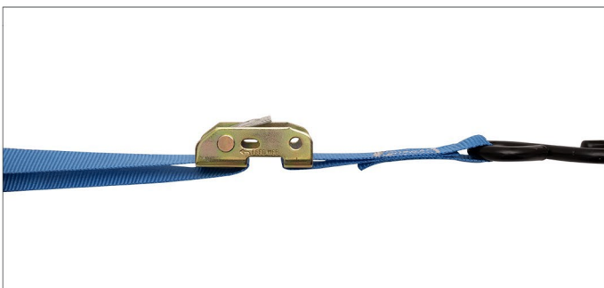
4 Release the lock plate to secure the webbing strap.