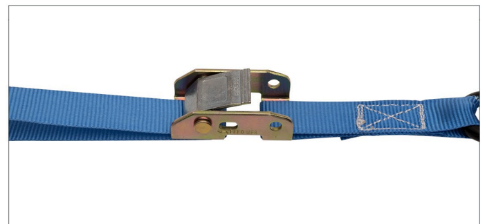
5 To adjust, press and hold the lock plate while pulling webbing strap.