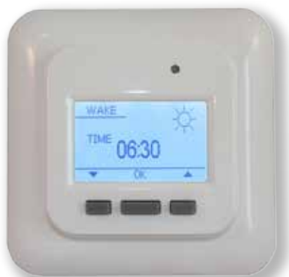
UFSTAT10 in Polar White

The 'Open Window' function monitors the room temperature for any sudden and sustained drops in air temperature, such as when a door or window is left open. If the thermostat sensors this situation it automatically switches off the heating system to stop wasting heat.