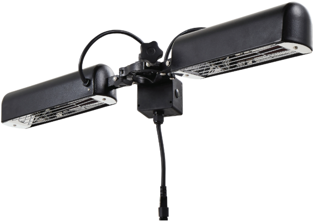
Topaz 2 x 800W Parasol Heater ZR 37448 BLK

This product has been manufactured to comply with EEC Directives 2006/95/EG and 89/336/EEC. Not household waste. Must be disposed of in accordance with local regulations.