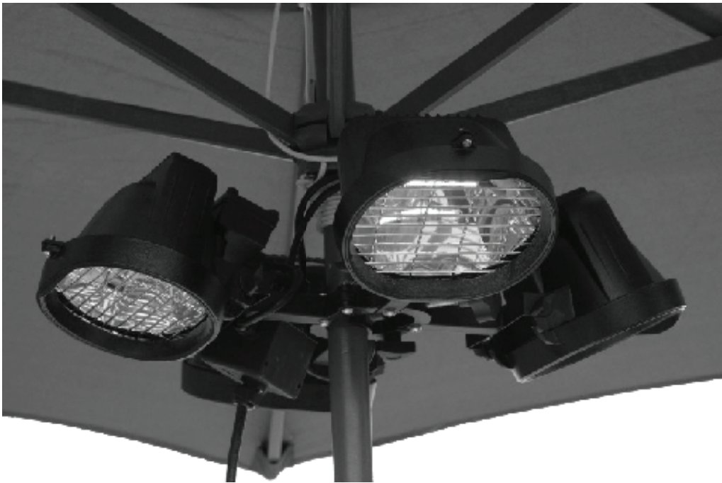
Ruby 4 x 450W Parasol Heater ZR 37445 BLK

This product has been manufactured to comply with EEC Directives 2006/95/EG and 89/336/EEC. Not household waste. Must be disposed of in accordance with local regulations.